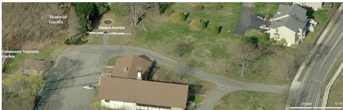
Original Site with empty Westside of Parish Grounds

Twelve years ago Grace Episcopal Church took a risk with the open ground to the west of the church that was all grass to be mown. Using gifts received on the occasion of the installation of a new rector and a Green Grant from the diocese, Grace Church purchased 18 heirloom fruit trees including some Roxbury Russets first cultivated in 1635 here in the Boston area.