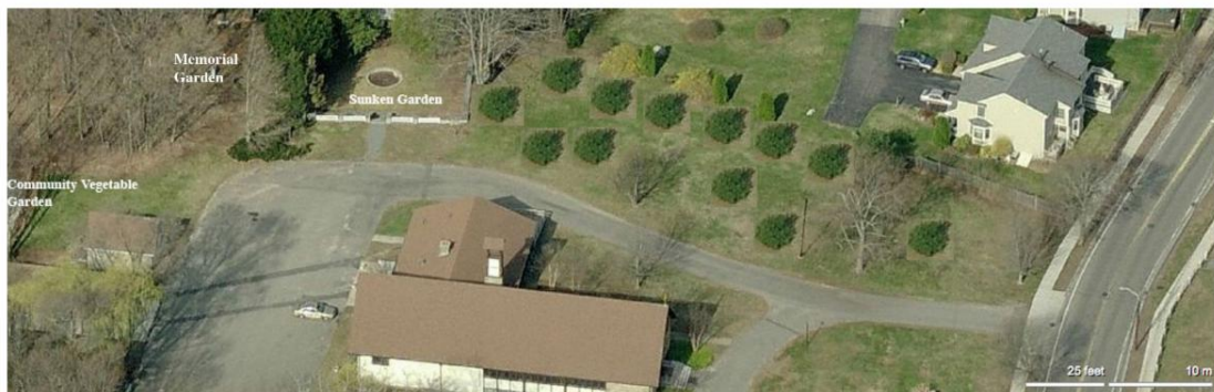
Proposal for Community Contemplative Orchard